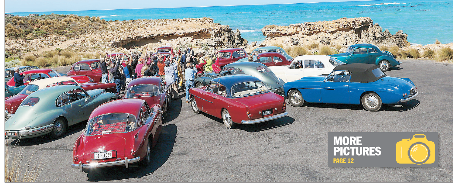
AROUND THEY GO: Bristol cars form the shape of a rotary engine at Southend Point as a Tiger Moth plane, piloted by Kym Redman, soars above.