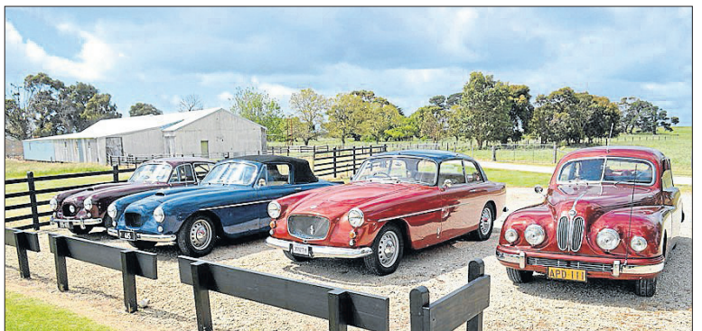
The Bristol Owners Club of Australia spent some time in the SE last week, here they are at Wangolina Station

Find us on: facebook www.facebook.com/coastal.leader